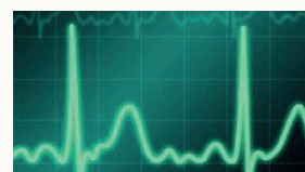
Heart Rate Variability Test