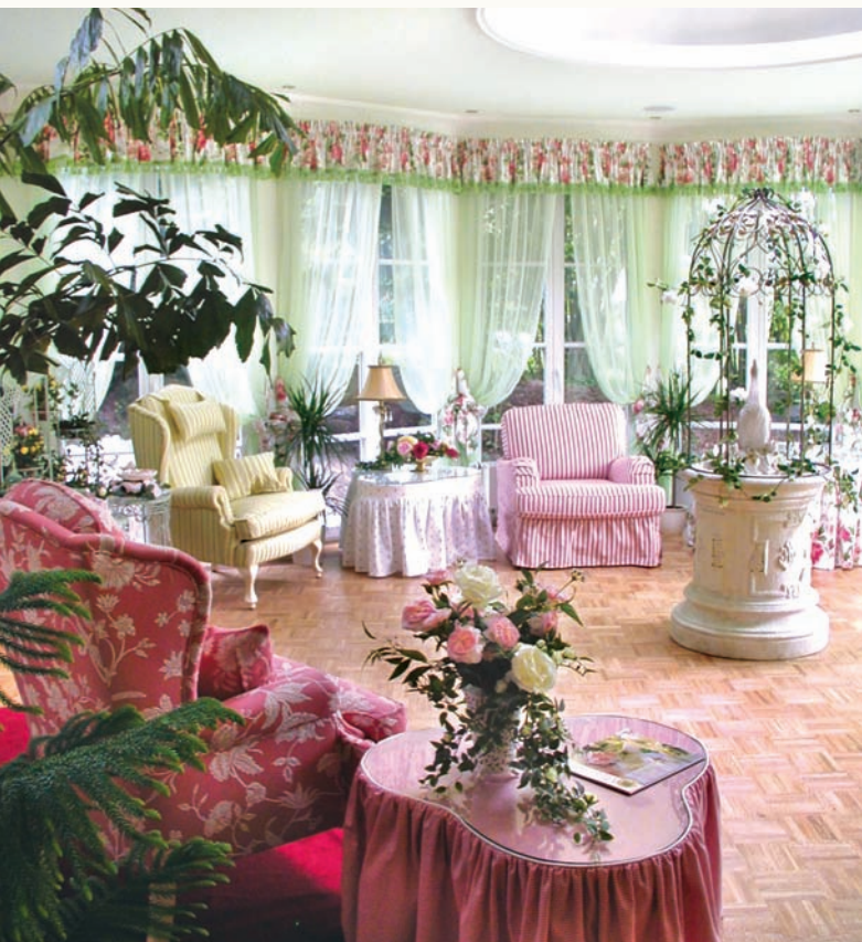
Unwind in the winter garden at HG Naturklinik Michelrieth