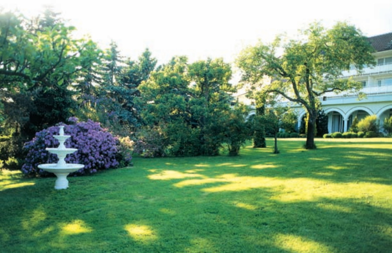
Relax in the park-like gardens at HG Naturklinik Michelrieth